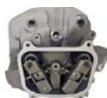
CYLINDER HEAD ASSY MODEL V (4 BAUT)

HORIZONTAL SHAFT 4STROKE AIR COOLED, OHV SINGLE CYL