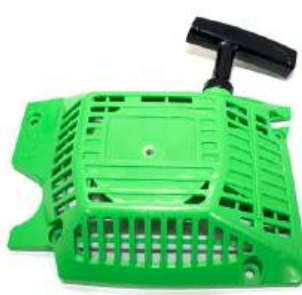
5900 (4 KEY)