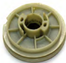
5200 2 KEY