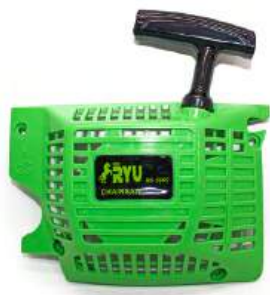
5200 (2 KEY)